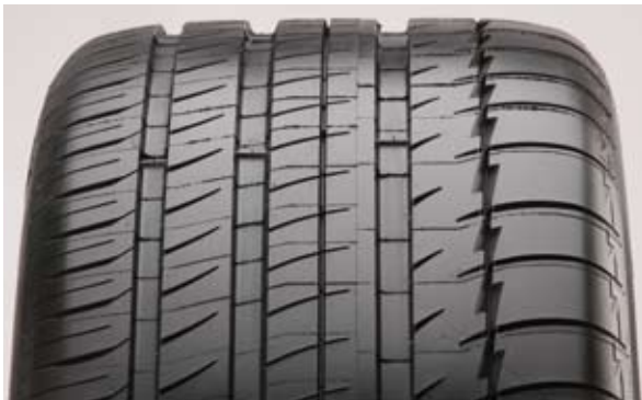
The Michelin Latitude Sport

maximum wear resistance. As with the Michelin Latitude Sport, they offer modest rolling resistance and therefore better fuel economy.