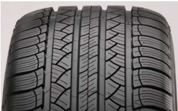
The Michelin Latitude Tour HP