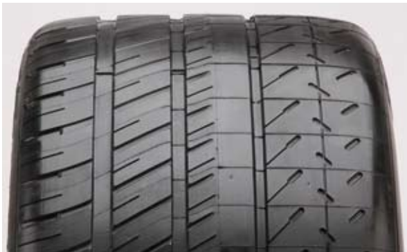
The Michelin Pilot Sport Cup

(Type 997) by Porsche engineers working in cooperation with Michelin. Only because of this it is allowed to bear the N classification – the sign of Porsche quality. The advantages offered by Michelin Pilot Sport Cup tyres are of vital importance for sports-oriented drivers.