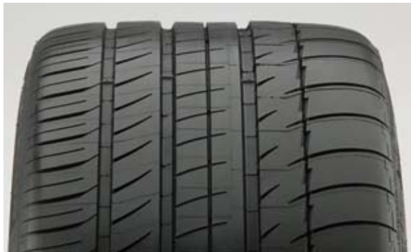
The Michelin Pilot Sport PS2

Another compelling feature of the new Michelin Pilot Sport PS2 is its excellent durability. The individual tyre compounds have been carefully selected to achieve balanced wear characteristics at front and rear. These high quality standards – and the resulting longevity – all contribute to the economy of the tyre.